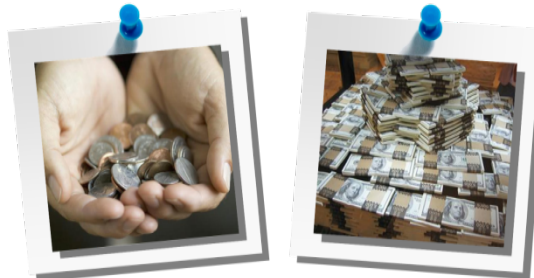
Limitations Lead to Habits