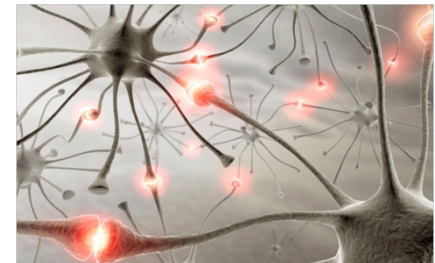
Learning = cog process